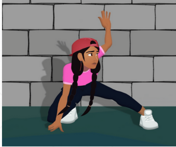
Lucha escapes detention