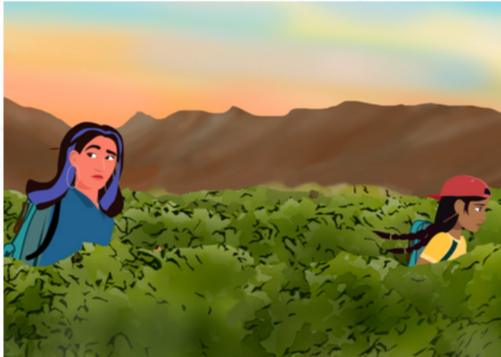
Trek through Andes