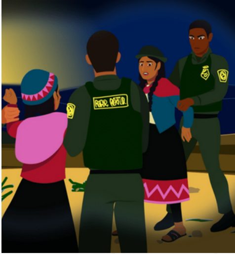
Separated at the border